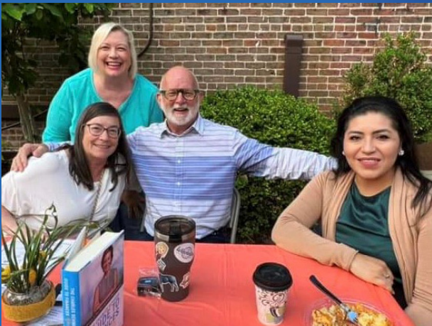
May 2023, Arts on Main Breakfast

Whether it's a new business in town or a longtime neighbor who hasn't joined yet, a personal invitation goes a long way. Share your Chamber experience, forward our newsletter to them, and bring them to an event.