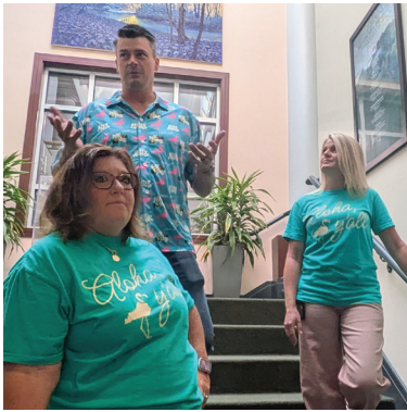
Ale-8-One celebrated launching Ale8 PawPaw at their first ever breakfast!

There's no better way to connect with fellow members and put your business in the spotlight than hosting a Chamber Breakfast or After Hours event. We still have 2026 dates available, and now is the perfect time to secure your preferred date!