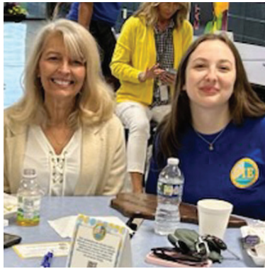
Partners In Education uses their breakfast as part of the Annual Volunteer Recognition