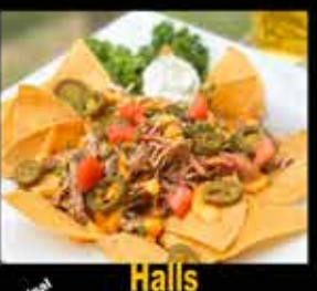
of Snappy Cheese Nachos