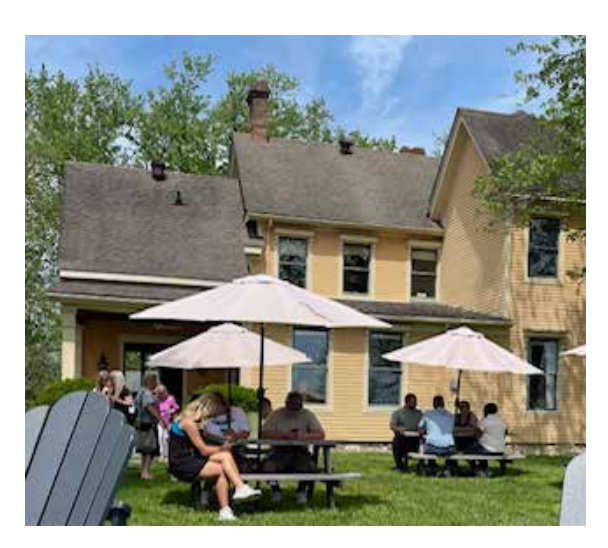
April 18 - After Hours at Leeds Center for the Arts