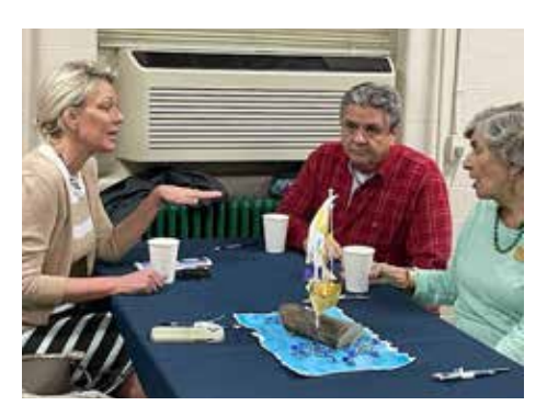
April 11 - Squared Away Junk Removal Ribbon Cutting