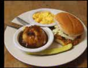
Jay K's Cafe Whats up Slaw? Pulled Pork Sandwich