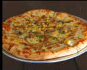
La Trattoria La Beer Cheese Pizza Pie