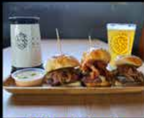
Bell on Wheels Giddy Up Horsey Steak Sliders