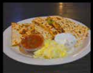
Woody's Don't Knock on Woody's Quesadilla