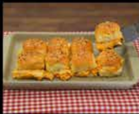
Full Circle Market Cluck Kick'in Chicken Sliders