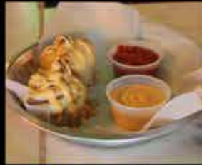
Engine House Beer Cheese Bangers