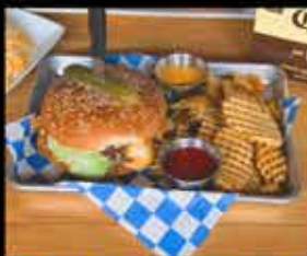
Tacos Luna y Mas De Queso Con Cerveza Burger