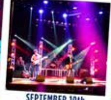
SEPTEMBER 10th TOM THE TORPEDOES (TOM PETTY TRIBUTE)