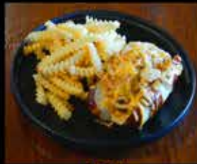
DJ's DJ's Brat-tomic bomb