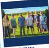
JUNE 11th THE BAJA YETIS