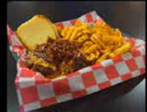
Smokin' Howards This little Piggy Loves Beer Cheese