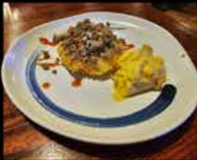
Amy's Asian Kitchen Crispy Crab & JP's Aged Beer Dip

THE CHEESIEST WEEK OF THE YEAR TRY THEM ALL, VOTE FOR YOUR FAVORITE! May 20-26