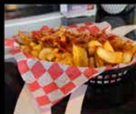
The View Yo Home Fry, try these!