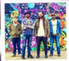
OCTOBER 8th DARK MOON HOLLOW