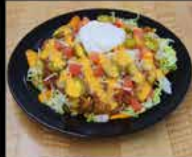
S. Main Grocery Fiesta Beer Cheese Salad