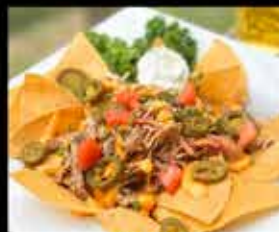
Halls Original Snappy Cheese Nachos