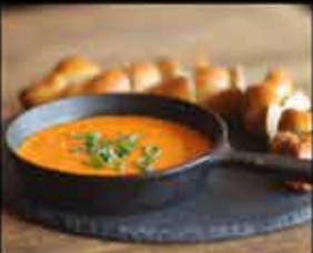
Loma's Brouski's Brewsky Cheese Twist