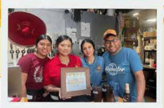
Tacos Luna y Mas