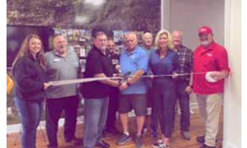
Disabled American Veterans Department of KY Chapter 12