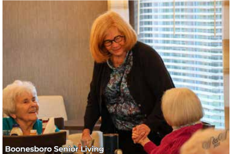
Boonesboro Senior Living