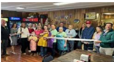
Pilot's View Market and Bakery