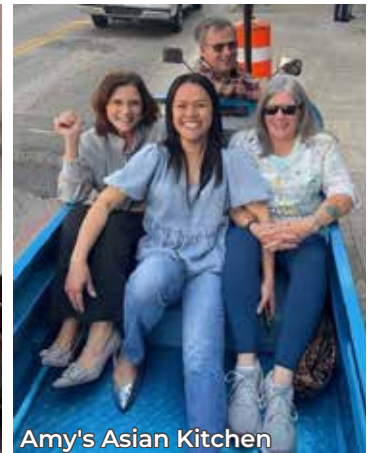
Amy's Asian Kitchen