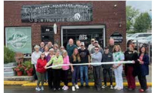
Beech Springs Table