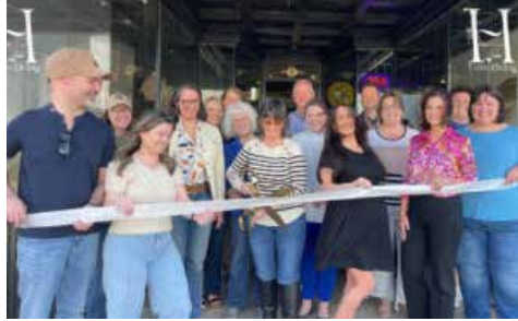
Harlow Luxe Living