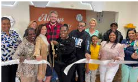
Designs & More