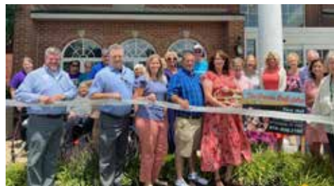
Powder Puff Salon