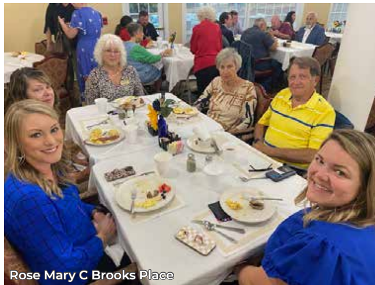
Rose Mary C Brooks Place