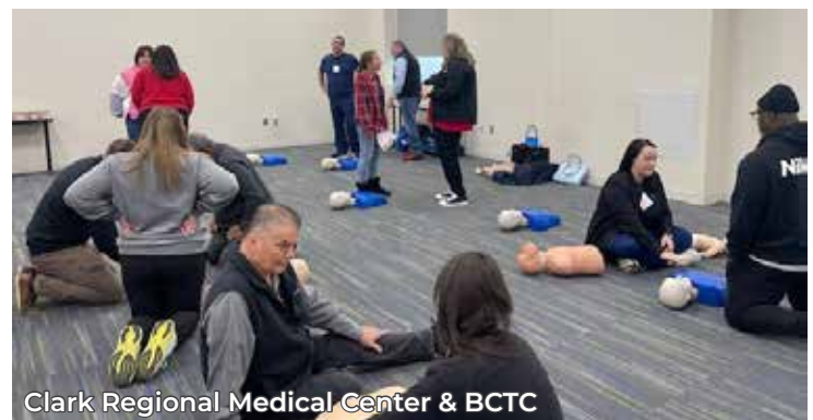
Clark Regional Medical Center & BCTC