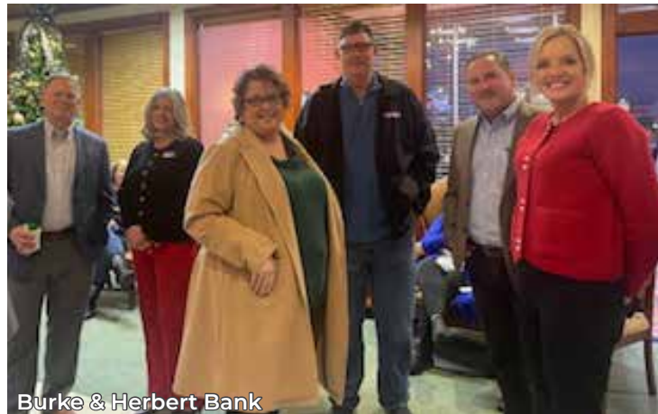
Burke & Herbert Bank

Thank you to every member who opened their doors to host, every attendee who showed up to connect, and every conversation that turned into collaboration. Here's to the moments that brought us together.