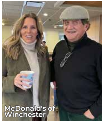
McDonald's of Winchester