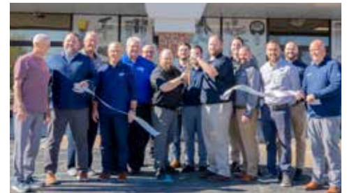
Air Hydro Power