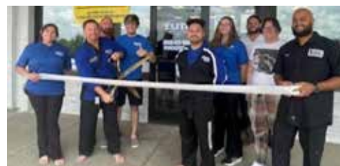
Elite Martial Arts