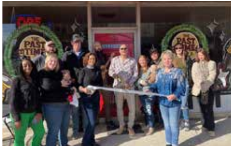
The Past Time