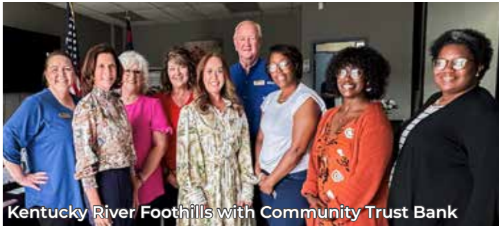
Kentucky River Foothills with Community Trust Bank