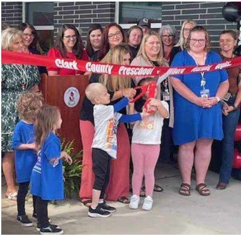
Clark County Preschool