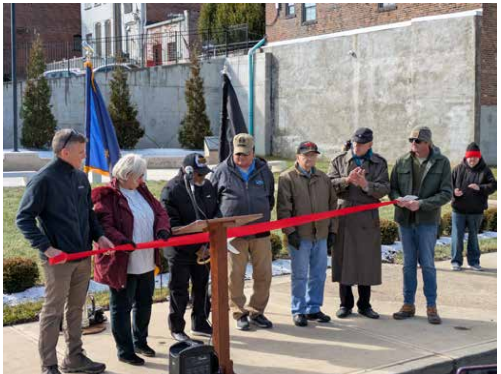
WWII and Korean War Veterans' Memorial