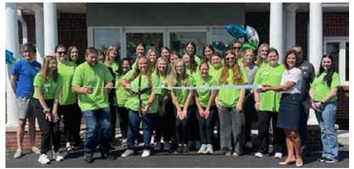
Bluegrass Pediatric Therapies