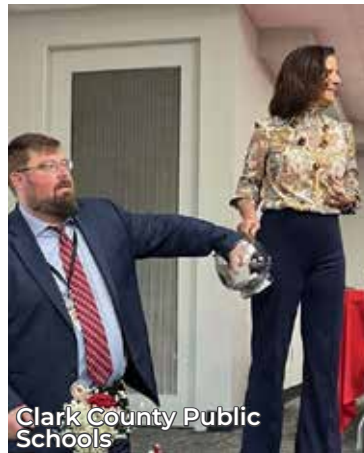
Clark County Public Schools