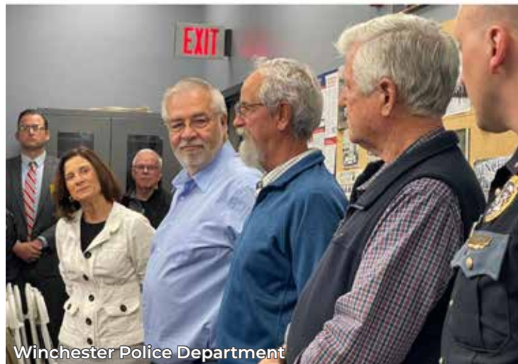
Winchester Police Department