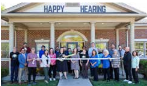
Happy Hearing Clinic