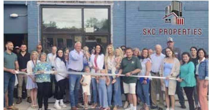
SKC Lexington Properties