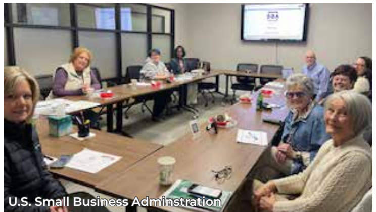
U.S. Small Business Administration