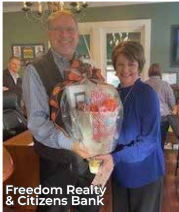
Freedom Realty & Citizens Bank

These events took us to different locations all across Clark County, giving members the chance to discover new spaces, learn what fellow businesses offer, and understand the diverse industries that make our community thrive. Whether you were exploring a member's newly renovated building at breakfast, learning about Artificial Intelligence at a Lunch & Learn, or catching up on the latest at an After Hours, each gathering created opportunities to connect with the people behind the businesses. And who knows—you might have even walked away as a door prize winner!