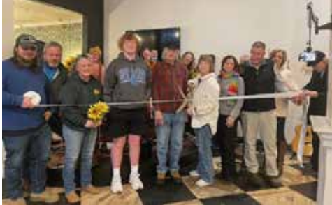
Heartstrings Songwriters Circle

This year brought us 23 ribbon cuttings that celebrated our community success. They didn't just welcome brand-new businesses, but honored new ownership transitions, milestone anniversaries, and special unveilings. Looking at them all together, we can see our Chamber's diversity—small businesses, retail, B2B services, medical practices, and industry all cut the ribbon! Among the year's most memorable moments were the unveiling of the Clark County Preschool building and the dedication of the WWII and Korean Veterans Memorial, proving that our community celebrates both commerce and the values that unite us.