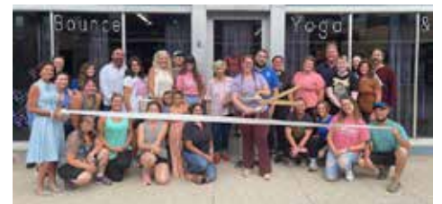
The Fly Witches